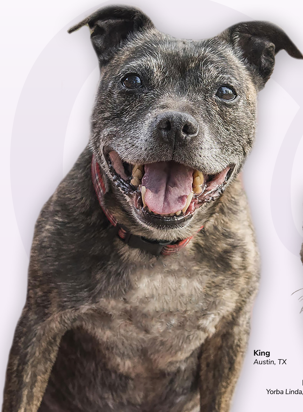
King Austin, TX