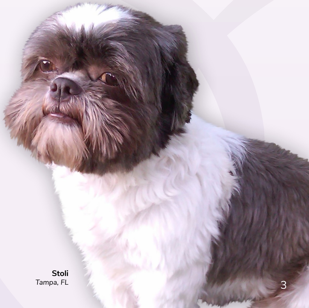
Stoli Tampa, FL