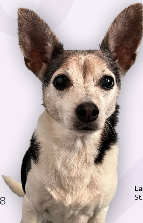
Layla St. Pete, FL

Scan the code or visit Info.LapofLove.com/Pet-Hospice for even more resources available exclusively to our hospice families.