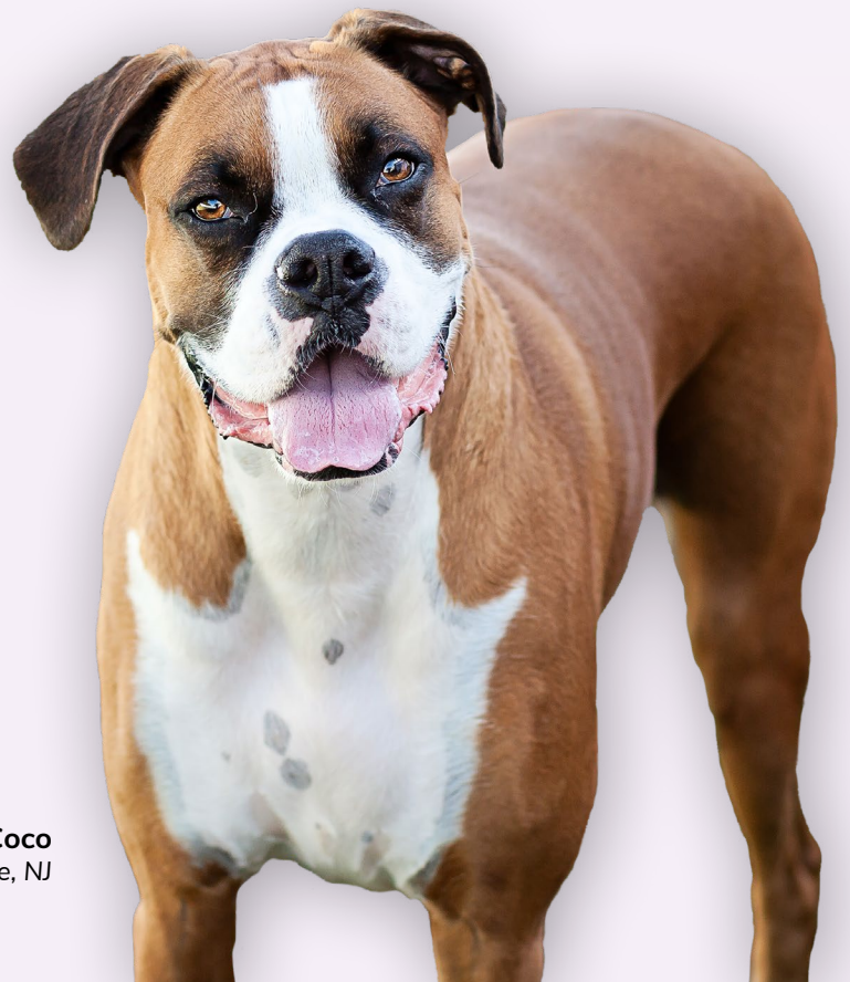
Coco Franklinville, NJ

We will make every effort to accommodate same day appointment requests, but it is best to schedule 24–48 hours in advance. If it is outside our Support Center hours and your pet is in distress, please reach out to your nearest emergency clinic.